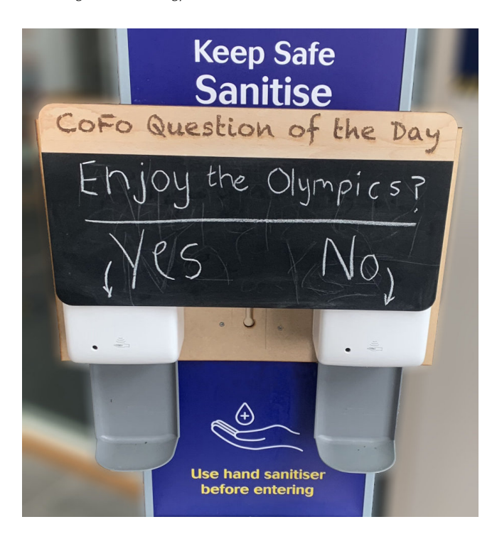
Figure 5: The SaniVoter Prototype. Entering a building, people are prompted to sanitise their hands. Our adapted version allows users to respond to a question via their choice of one of the two separate automatic hand sanitiser dispensers.

5.2.2 Summary. Our investigation into discreet touchless feedback has provided promising early results which could improve the privacy and security of public PIN entry devices. It could also provide haptic feedback for both input and output of information for visually impaired users in other situations.