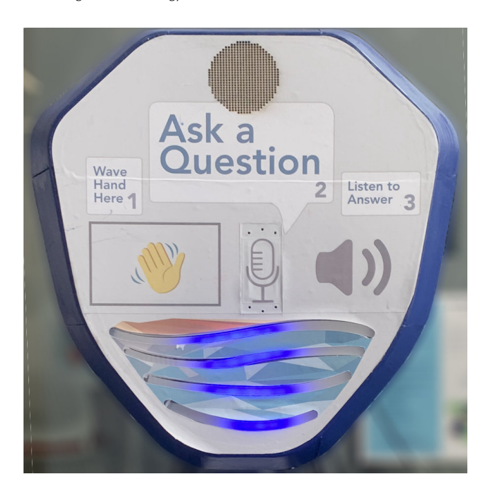
Figure 7: The SpeechBox prototype. Waving at the device triggers an audio prompt (via the speaker, top) to verbally ask a question. After an answer is provided, the user waves left or right to give feedback on the response's accuracy. LED strips at the bottom provide wave and status feedback.

technology of some form with an unknown purpose, 17 % suggested it was some sort of game, and 8 % had no idea.