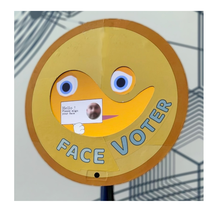
Figure 6: The FaceVoter prototype. Approaching the device, a user's face is detected and the screen prompts them to answer Yes or No to a question by smiling or frowning.

long enough for it to detect their face, but walked away before recognition could take place. Disregarding these instances, the accuracy of the system at detecting smiles or frowns (as determined by observation) was approximately 80%. During the observation sessions, our research team noted that passersby noticed the device (i.e., were visibly seen to look at it for more than just a glance) around 40% of the time and chose to subsequently use it, unprompted, around 5% of the time. Of the 545 total interactions, 187 were after prompts from a researcher.