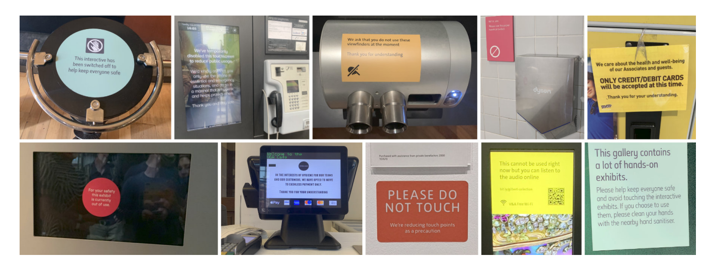
Figure 1: Disabled or modified interactive public technologies are commonplace in the new COVID-19 world. As we report in this paper, the potential risks and ongoing anxiety related to touching shared surfaces have, in many cases, resulted in user avoidance or provider adaption of such interfaces. While many of the examples shown here are perhaps merely inconvenient—for example, being unable to experience interactive exhibits, or having to use paper towels instead of a hand drier—others can pose accessibility or safety issues. For instance, replacing public technology with app-based alternatives negatively affects people without smartphones or those with low technological ability, while a refusal to accept cash disadvantages those without bank accounts. Further, many public-space technologies such as pedestrian crossings or ATMs provide vital services and therefore cannot simply be disabled in this manner.

There is no doubt that the COVID-19 pandemic has changed the way we behave, and in particular how we interact with people and objects, including these types of ubiquitous public utilities. While more recent research has nuanced early findings and shown that shared surface contact is rarely the cause of infection [14, 18], it has also been shown that much of the general public are still comforted by deep-cleaning [31, 39], with many so anxious that they entirely avoid touching objects in public spaces [6, 62]. In the new world of face masks and social distancing, it is understandable to feel on-edge about the potential for harm from germs left by others. This change in attitude puts into question whether the physical contact required to use shared interfaces is worth the risk. As a consequence, people may be attempting to adapt how they use these services, or making the choice to simply avoid them altogether.