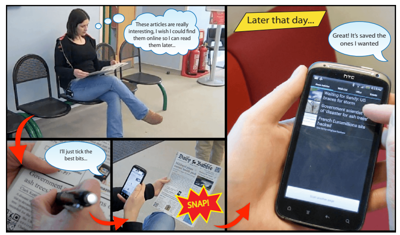
Fig. 1. Using TicQR to interact with a newspaper. Left: reading a newspaper, finding and then ticking interesting content. Right: browsing saved items at a later time.

The TicQR design aims to bridge the physical-digital document gap in a manner that is minimally intrusive to the user. The system allows people to read a paper document, mark which parts they are interested in, and archive them digitally by taking a single photograph using a standard smartphone handset (see Fig. 1). This approach allows multiple 'clippings' on a page to be recognised and interpreted simultaneously, then presented to the user for browsing or later use. We envisage many scenarios where TicQR could be useful, some of which are illustrated later in Fig. 2.